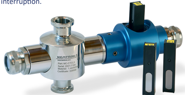
Integrated NIST validation accessory

The convenient range of small-footprint, zero dead-volume hygienic measurement cells that contain no electronics or moving parts are well suited for both ordinary and hazardous area installation. Standard NIST-traceable validation filters can be used to verify analyzer performance without process interruption.