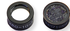
left: Optical filter used on a Kemtrak DCP007-UV photometer right: Eroded optical filter from a traditional hot mercury vapor lamp photometer

The proprietary dual wavelength, four channel measurement technique used in the DCP007-UV analyzer provides deep absorbance measurement to 5 AU using a 1 cm optical path-length. A range of shorter optical path-lengths allow for even deeper absorbance and optical density measurements.